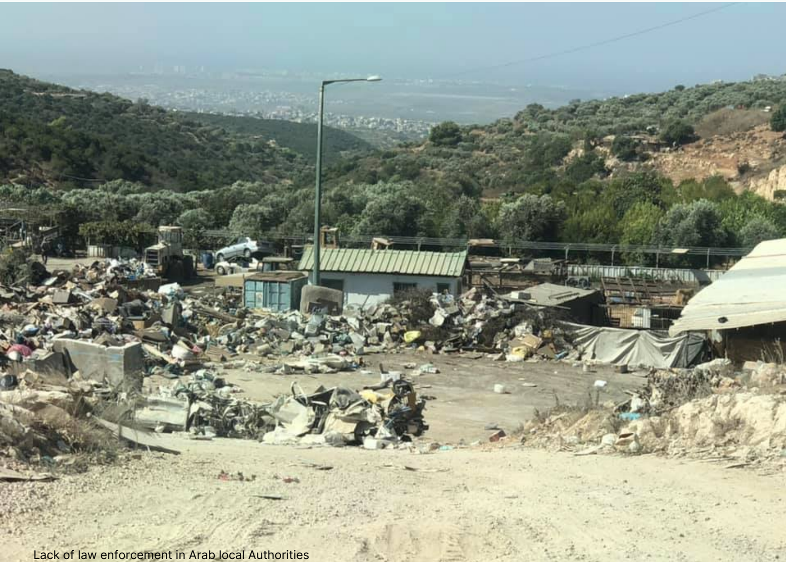
Lack of law enforcement in Arab local Authorities