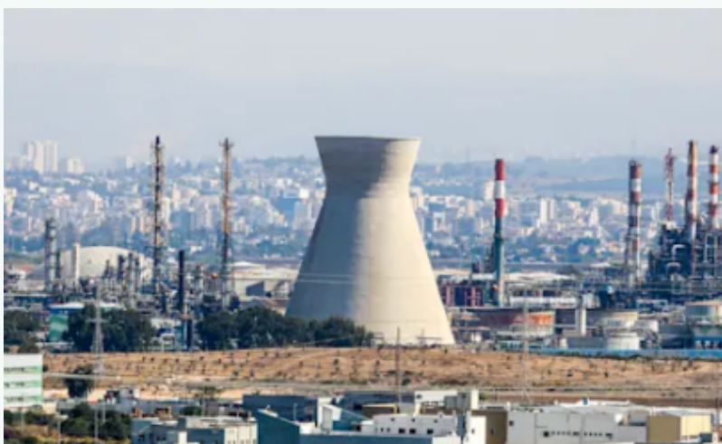
Air Pollution in Haifa Bay

In February 2021, we kicked off the year with the unprecedented ruling of the class action, filed in 2019 against mass exposure to air pollution in Haifa Bay. The ruling set a precedent allowing thousands of residents the possibility of jointly suing polluting factories in Haifa Bay